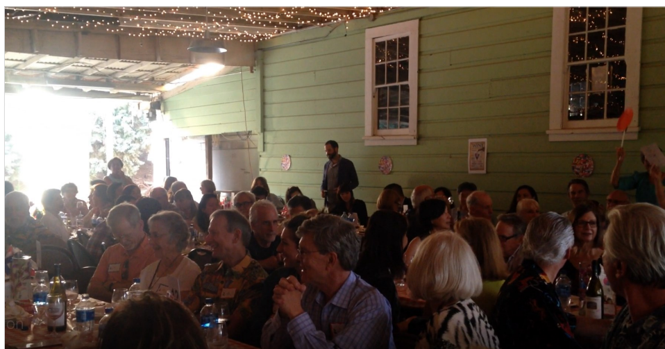
Friends of CHS enjoying music, food, and fun!